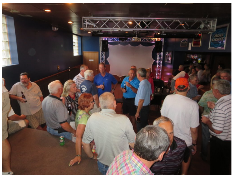
Upstairs at Roc's-Friday night

People were standing around in groups laughing, drinking and conversing or doing the same within the booth seating and other table/chair seating located randomly within the confines. Brothers would spend time within one group and then saunter off to another group of guys and gals, to scoop up as much information as they could about old friends. Constant chatter