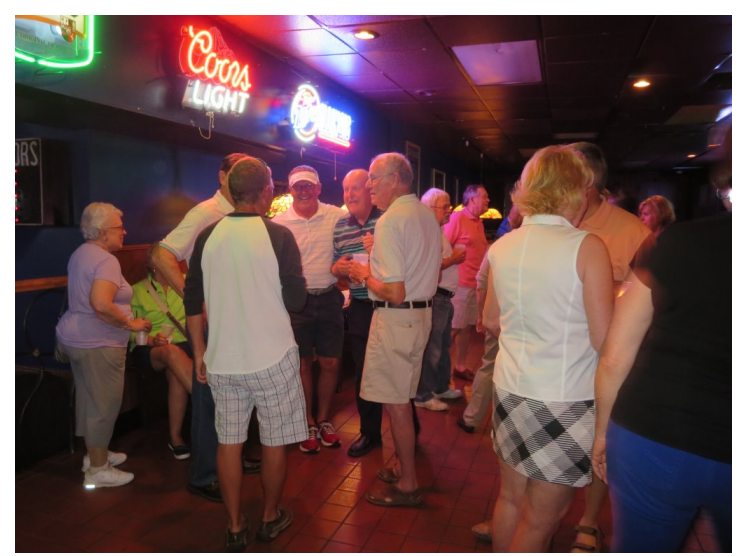
Upstairs at Roc's - Friday night