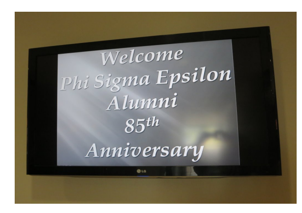
Entrance to the U-Hotel Foyer

attending the Vineyard tour, it was time to start thinking about the highlight of the evening, the Reunion Banquet and the attendant program following that meal. Still, there was more time in the early to later afternoon for mixing within and outside of the hospitality room. Steady streams of primarily Brothers met and conversed about past events and upcoming activities in their livesbaseball and the Cubs vs. Cardinals supporters are always lively subjects when we get together. At that time in